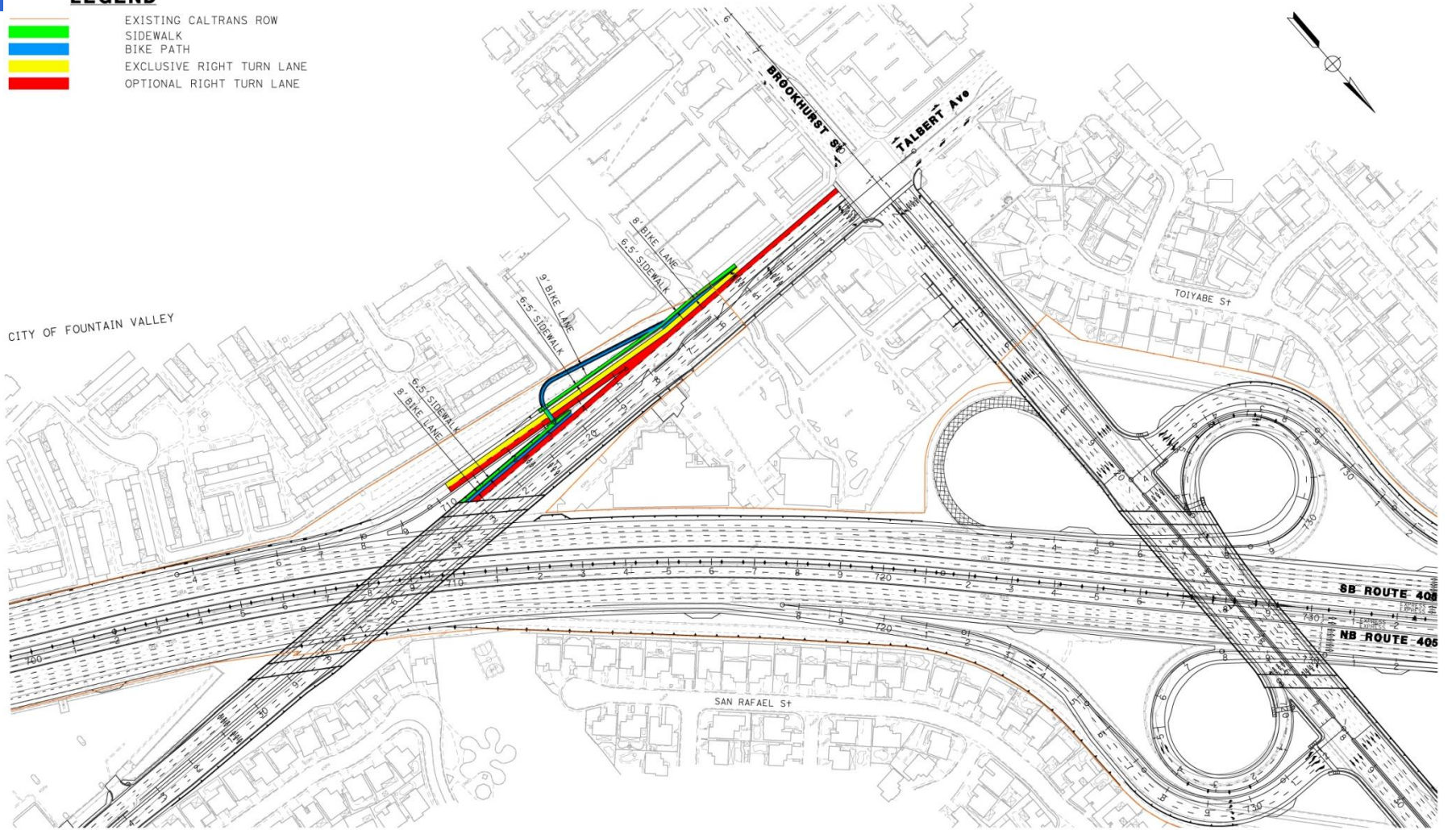
I-405 IMPROVEMENT PROJECT BIKE/PEDESTRIAN EXHIBIT TALBERT Ave AND BROOKHURST St