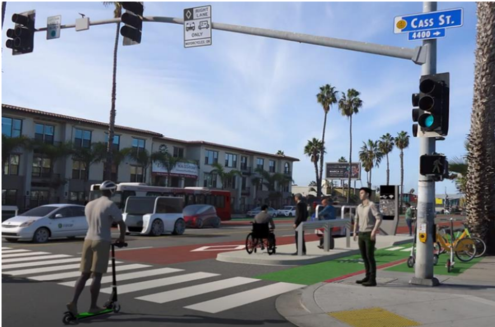
San Diego, Mobility Hub

... are places of connectivity where different modes of travel seamlessly converge