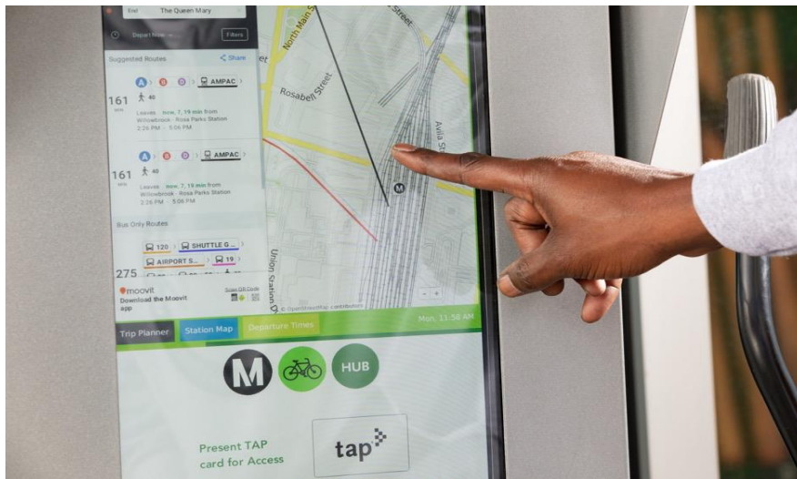
Tranzito Mobi kiosks

... are part of a physical/ digital/ policy framework to connect all modes of mobility to encourage multimodal travel.