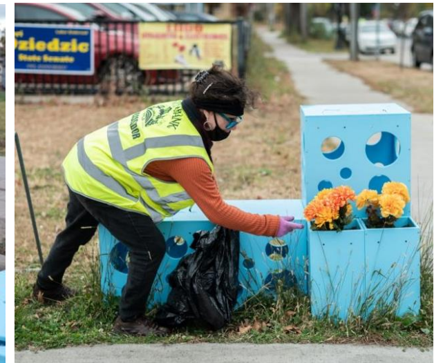
Minneapolis, Mobility Hubs