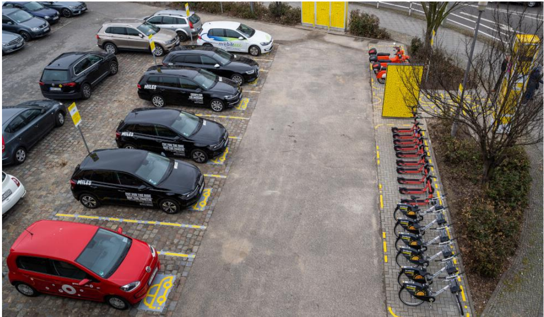
Berlin, Jelbi Station