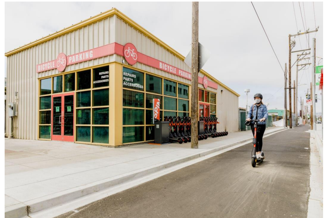
San Francisco, Caltrain SF Mobility Hub