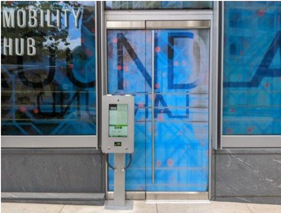
Los Angeles, Wilshire Grand new mobility hub

.. provide a focal point in the transportation network that seamlessly integrates different modes of transportation